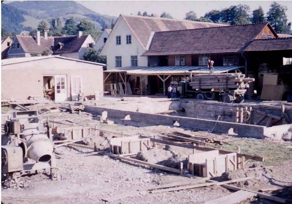
Expansion continues with the construction of the main hall.