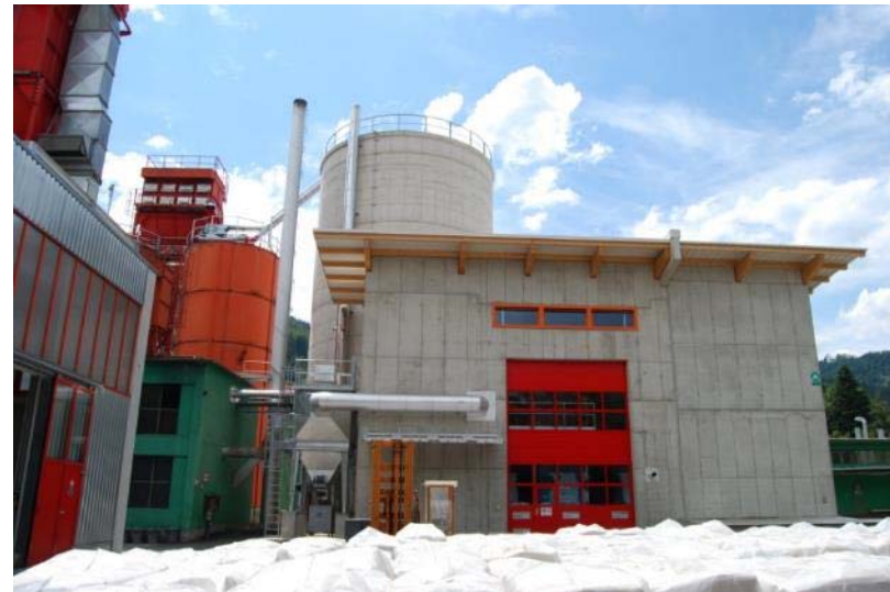
Heating plant - Übelbach