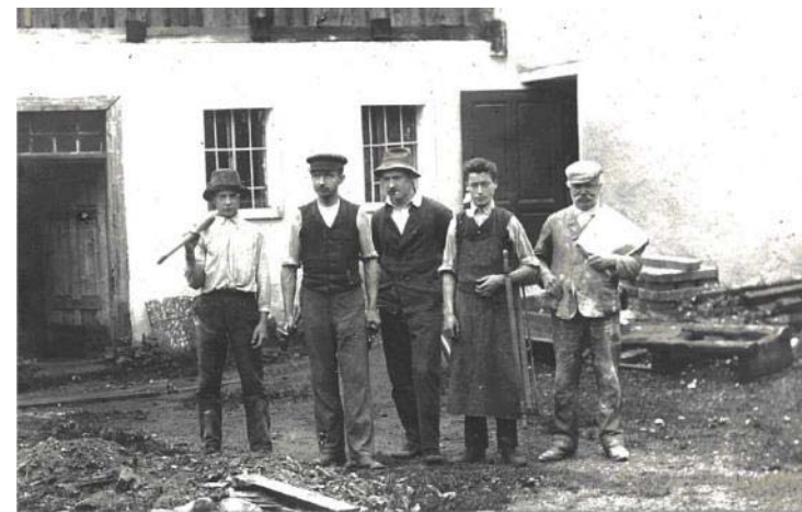
The first employees (1925)