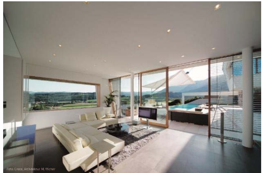
All-Glass Solution VISIONLINE

GAULHOFER offers windows for prominent architectural solutions and displays that progressive aesthetics can also be combined with superior insulation values.